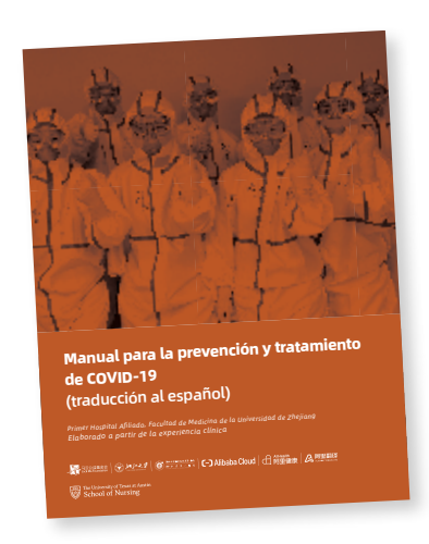
Spanish language COVID-19 Manual