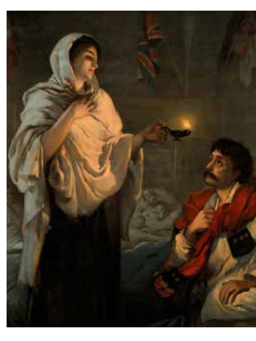
Florence Nightingale advocated for six environmental themes:

Florence showed us what service looks like. It is not always an easy path to follow, and at times it may push us beyond boundaries that we have previously known. Nurses and other health care workers engaged in the COVID-19 pandemic are being rightly celebrated today as heroes. They follow in the footsteps of other nurse heroes who served in numerous wars in the past two centuries and the nursing hero we celebrate this year, Florence Nightingale.